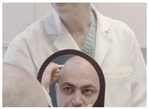
Surgical Pen Evaluation

Proper assessment of patient expectations before surgery is a vital part of this consultative process. One cannot have satisfied patients without meeting their expectations. To meet the patient's expectations, a physician needs to do the following: Assess a patient's initial expectations; determine the potential achievable aesthetic results for this specific patient; inform the patient about realistic expectations.