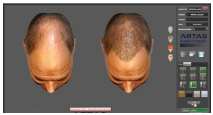
ARTAS Hair Studio Simulation

When the patient first visits the clinic for their consultation, my staff takes five photographs of their face and head (front, back, top, left and right profile). These photographs are uploaded and then my staff or I create the 3D model on the ARTAS Hair Studio technology. The process of model building typically takes less than 5 minutes. This is completed prior to my sitting with and consulting with the patient.