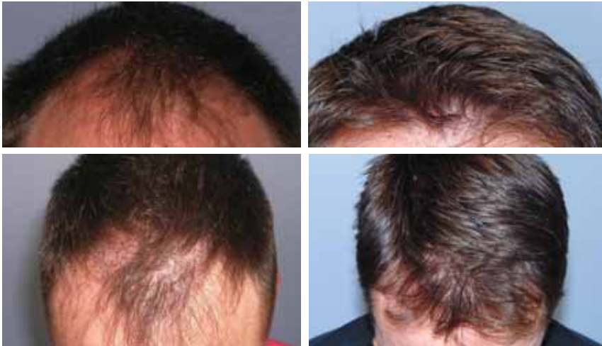
Patient above is shown before (left) and after treatment with the ARTAS System.